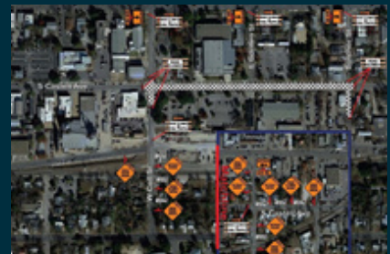
South Castell Ave