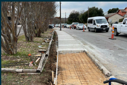
Common Street Pedestrian Improvements