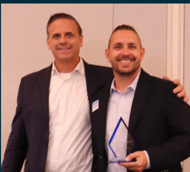
Skillpoint Alliance Ambassador Award