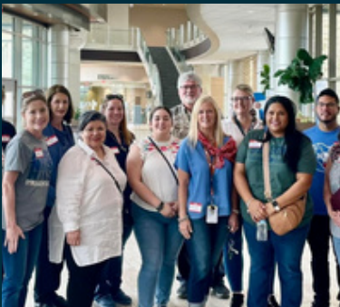
Teacher Externship Program