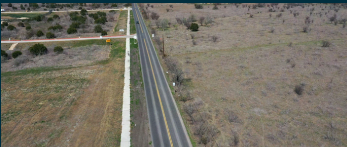
Kohlenberg Road Improvements