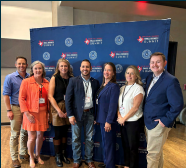
Governor's Small Business Summit