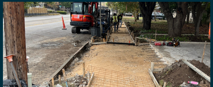
Citywide Pedestrian Improvements