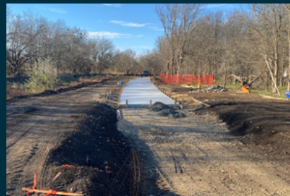
West Alligator Creek Trail