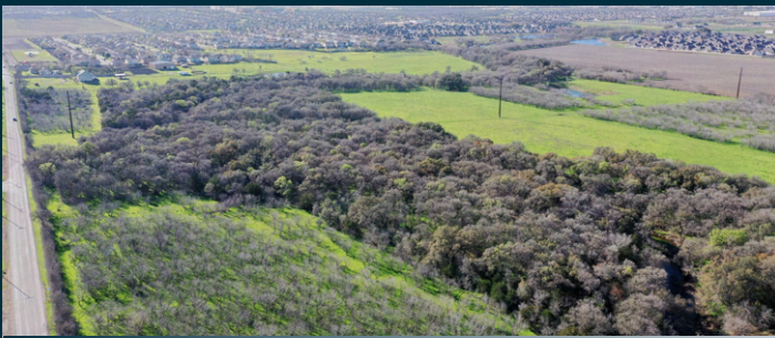
Northwest Parkland Acquisition

Since the beginning of Confluence in 2023, the New Braunfels Economic Development Corporation has invested more than $42 million back into our community. Supporting transportation, infrastructure, small business, and quality of life projects will continue to position New Braunfels as a community of choice for residents to live, work, and thrive.