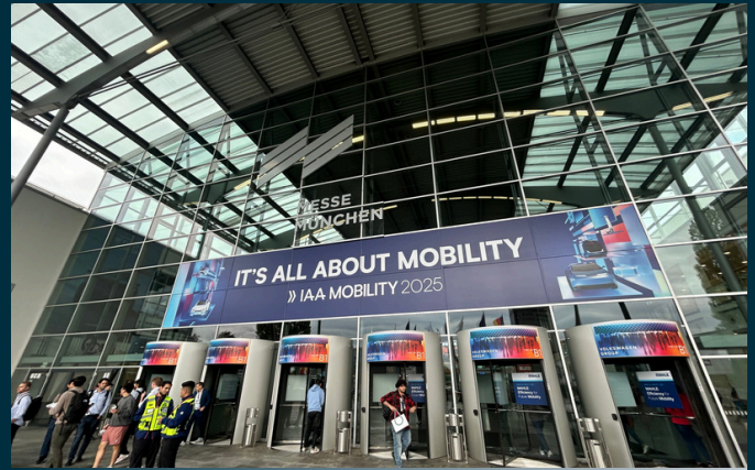
IAA Mobility Conference 2025