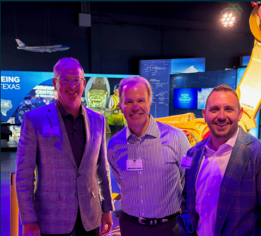
Texas CyberForge Site Visit