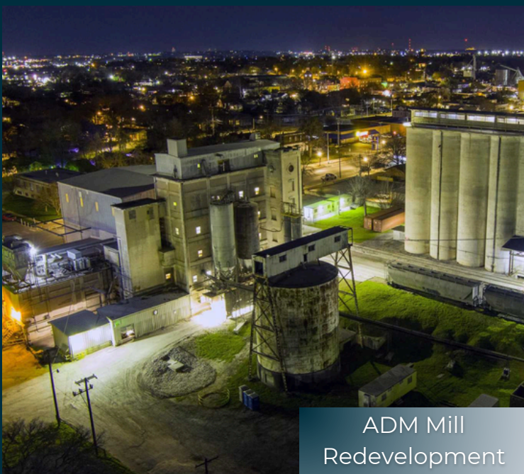
ADM Mill Redevelopment