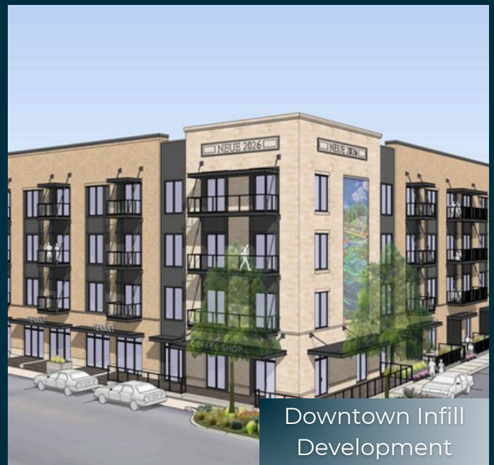
Downtown Infill Development