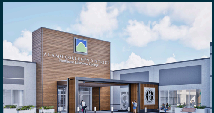
Northeast Lakeview College