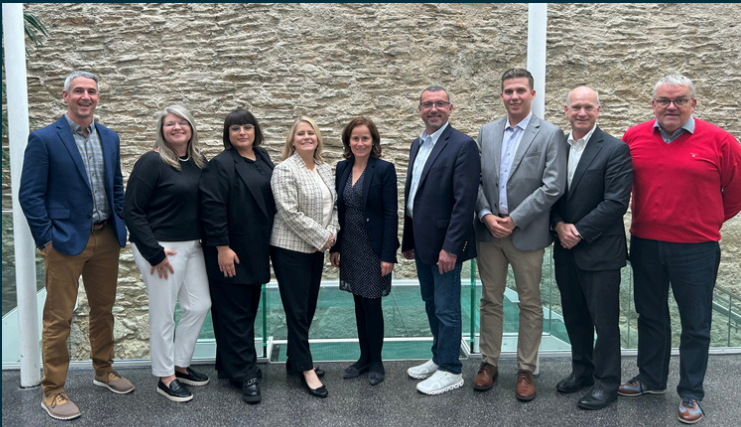
TBIC Germany Foreign Trade Mission

In 2025, we joined the Transatlantic Business & Investment Council (TBIC) on a four-day trade mission to Germany, engaging with industry leaders across Baden-Württemberg, Rhineland-Palatinate, and Bavaria and concluding at the IAA MOBILITY Show in Munich. The purpose of this mission was to strengthen relationships with German companies already operating in our region, such as Continental/Aumovio, while advancing conversations with firms actively exploring U.S. investment opportunities. The delegation met with 12 German companies interested in expanding in the United States. The mission reinforced our region's global competitiveness and deepened transatlantic ties in key sectors, including automotive, food, and advanced manufacturing.