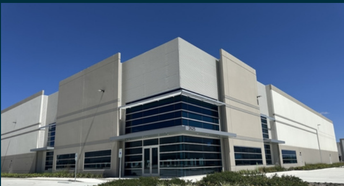
Lefko USA Headquarters

Since Confluence launched in 2023, the New Braunfels Economic Development Corporation has reinvested more than $54.5 million into the community. Continued holistic support for transportation, infrastructure, small business, education, and quality of life projects will help ensure New Braunfels remains a place where residents can live, work, and thrive.